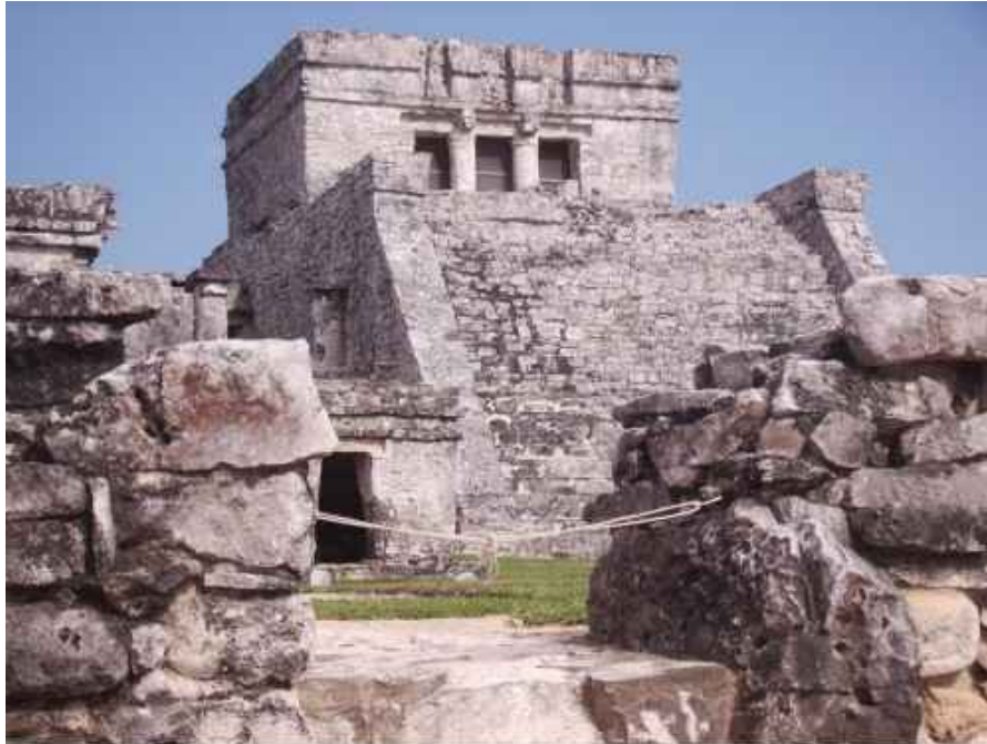
The Mayan Temples of Tulum